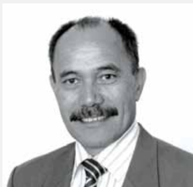
Lt Gen The Rt Hon Sir Jerry Mateparae

Kia ora, nga mihi ki a koutou. It is a great pleasure to provide my first Patron's message for the 2012 Annual Report of Surf Life Saving New Zealand.