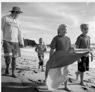
Photo: Juniors assist lifeguard setting up patrol