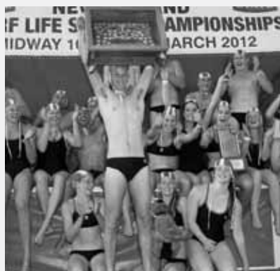
2012 National Champions Midway SLSC