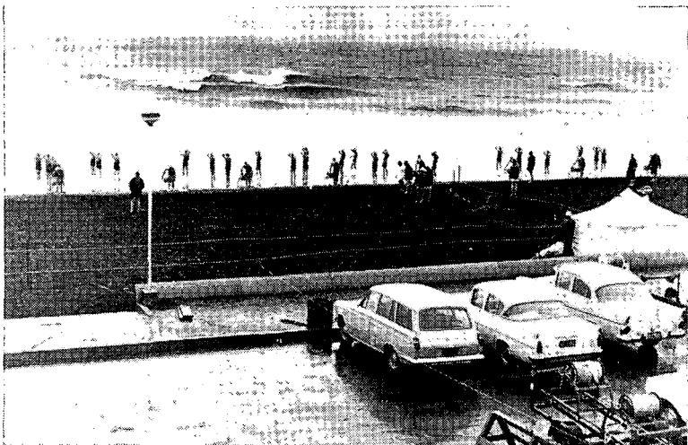
Inter-Districts Surf Carnival at Castlecliff