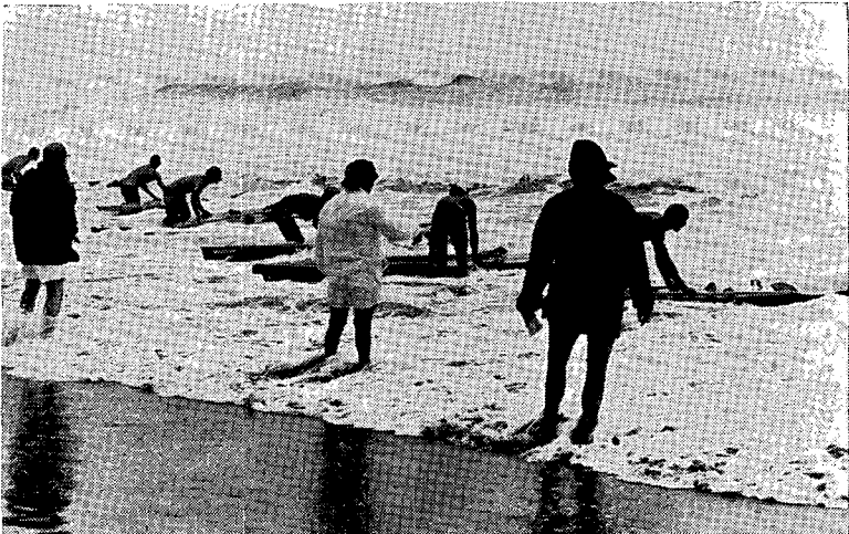
Inter-Districts Surf Carnival at Castlecliff

Canterbury (29 points) 1. Auckland (27 points) 2. Hawke's Bay (22½ points) 3. Taranaki (16½ points) 4.