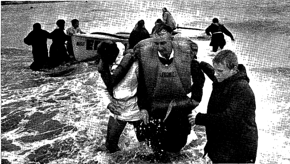
The first fully sponsored surf boat in New Zealand presented to the Worsler Bay Surf Life-saving Club Inc., by Europa Oil (N.Z.) Limited, lands survivors rescued from the sea following the foundering of the Wahine on the 10th April, 1968.