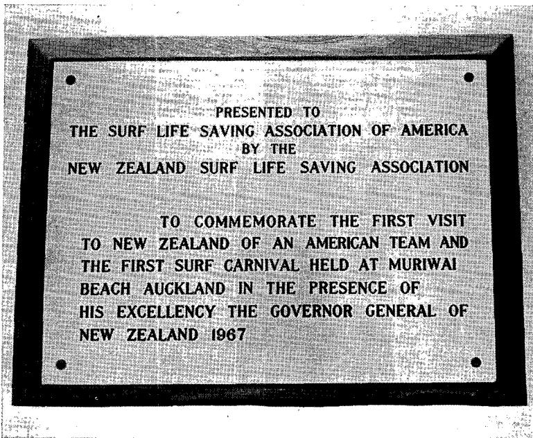
Commemorative Plaque presented to Surf Lifesaving Association of America.